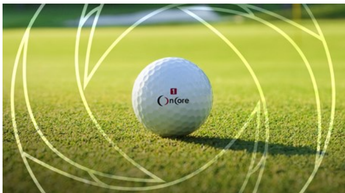
SPRING FOURSOME SCRAMBLE @ THE FOX VALLEY CLUB

Please take a moment to express your gratitude via mail, email or social media when possible.