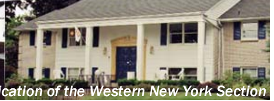
Official Publication of the Western New York Section